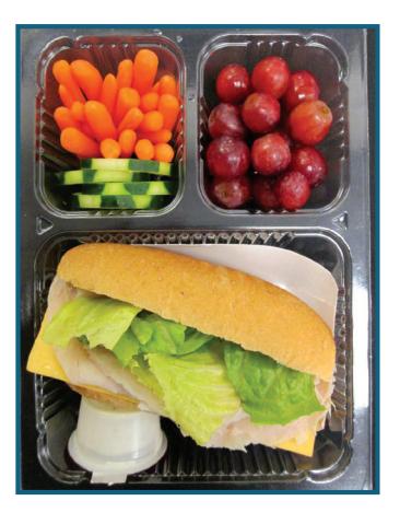
#82725 - Lid Available - Clear