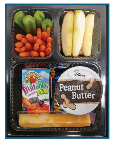
#82723 - Tray - Clear