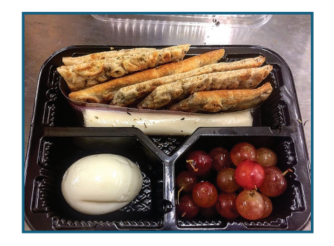
#21903 - Black Snack Tray