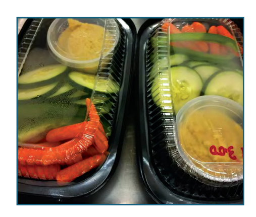
#21361 Medium Combo Platter