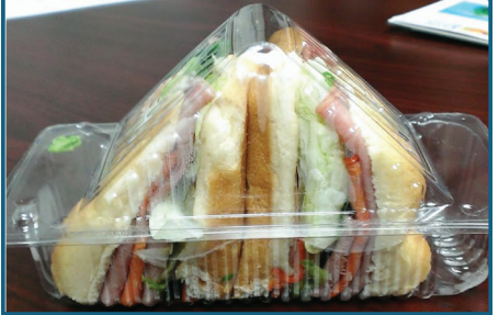
#21507 - Small Sand-Wedge®