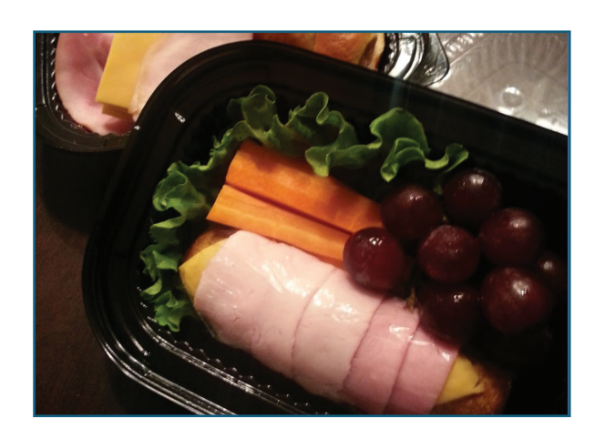
#21121 Small Combo Platter