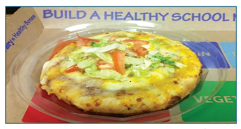
#24500 - Lid for 16 fl. oz. & 24 fl. oz. Invisi-Bowl<sup>®</sup> 5" Mexican Pizza