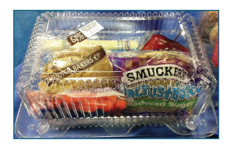
#2009 - Extra Deep Lunch Box